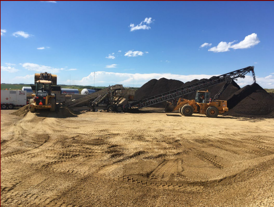
Bulk Winter Cold-Mix